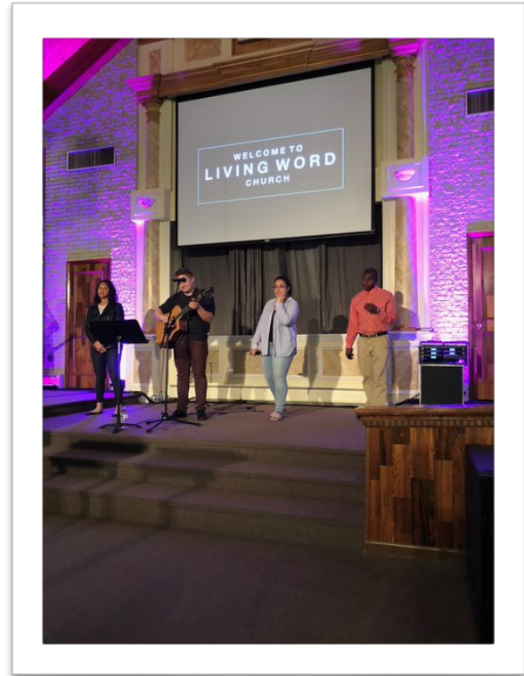
Living Word Church, Union, NJ